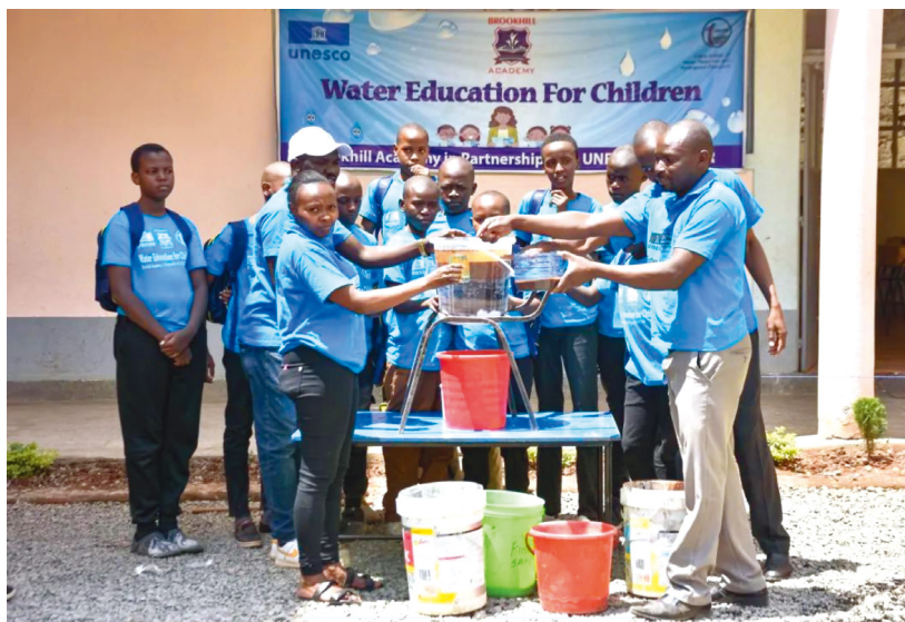
Teachers and students in Brookhill Academy in Nairobi making a sewage filter

In 2022, the China Institute of Water Resources and Hydropower Research (IWHR), after jointly compiling and publishing the English version of Water Education series with the UN Educational, Scientific and Cultural Organization (UNESCO), launched a series of activities to advance water education in African schools.