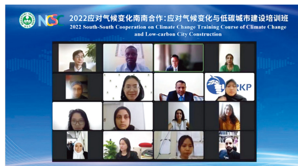
South-South Cooperation on Climate: Training Course of Climate Change and Low-carbon City Construction

Strengthening South-South cooperation and empowering developing countries to address climate change. Climate change poses challenges to economic, social and sustainable development