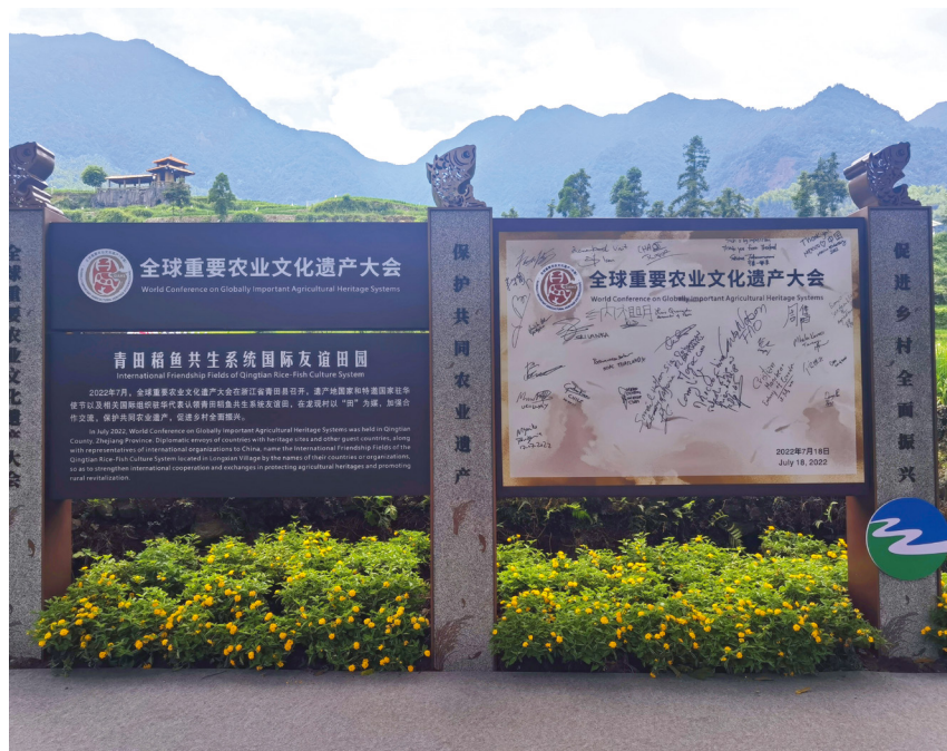
Signatures of the representatives of the World Conference on Globally Important Agriculture Heritage Systems

July 2022, the World Conference on Globally Important Agriculture Heritage Systems was successfully held in Qingtian, Zhejiang Province. 28 countries and international organizations supported the launch of the Initiative for Agrarian Civilization Protection, calling for prioritizing conservation and further raising international awareness of agricultural cultural heritage and its protection. The role of agriculture heritage should be fully leveraged in ensuring food security, adapting to climate change, and