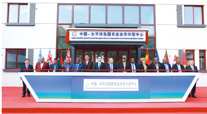
Inauguration Ceremony of the China-Pacific Island Countries Demonstration Center for Agricultural Cooperation

Carrying out technical cooperation and training to improve food production and self-sufficiency in developing countries. Agricultural