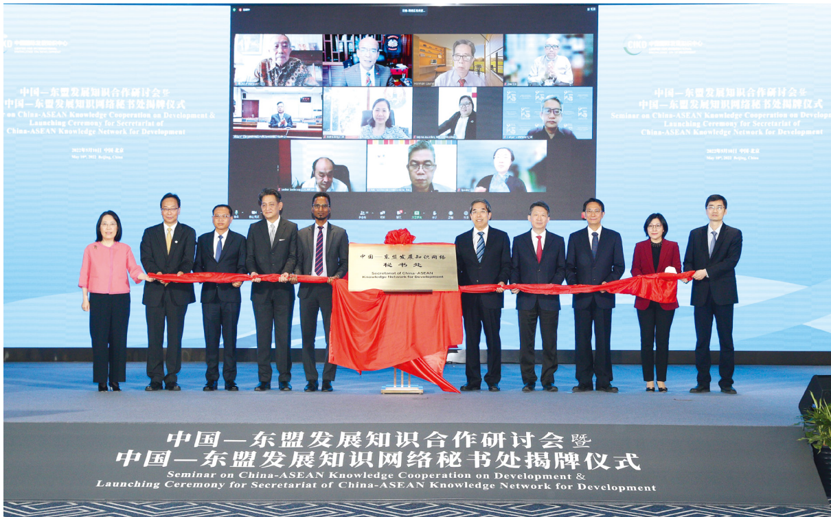
Launch of the Secretariat of the China-ASEAN Knowledge Network for Development

ASEAN Economic and Financial Cooperation since the Asian Financial Crisis and the Way Forward”. In the future, China will explore the establishment of other regional networks and thematic networks on poverty reduction, clean energy development, among others.