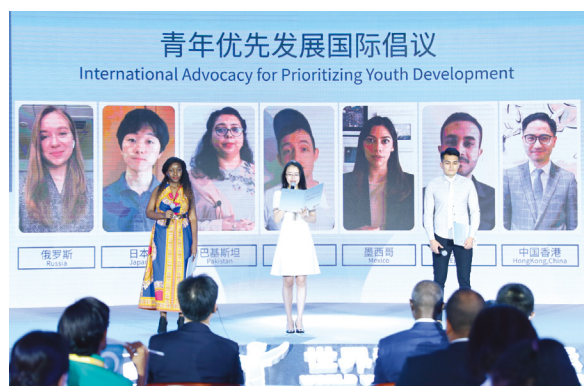
Youth representatives drafted and unanimously adopted the International Advocacy for Prioritizing Youth Development

education. The International Advocacy for Prioritizing Youth Development, put forward at the Forum, highlights priority for youth development in national and international development agendas, and calls for action and creativity to promote global and youth development. In October 2022, the Action Plan for Global Youth Development was inaugurated to solicit 100 excellence actions to demonstrate how the youth promote global development and how global efforts are made to promote youth development. In February 2023, at the World Digital Education Conference, representatives from governments, educational institutions, enterprises and international organizations explored ways to boost post-COVID educational