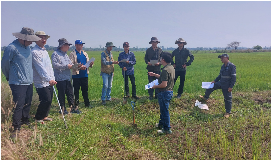
Field training in geochemical surveys of green land in Laos

mechanism for joint innovation activities at regional and global levels in such areas as digital and innovative agricultural finance, digital agriculture and agricultural information platform development, animal and plant disease control, sustainable soil and water management, and rice genetic breeding. In May 2023, the China-Pacific Islands Agricultural Cooperation Demonstration Center was inaugurated, which will carry out technological innovation in agricultural production and training in advanced and applicable agricultural production technologies with a focus on the needs of Pacific Island countries in crop varieties, fisheries and aquaculture, tropical cash crops, agricultural machinery and equipment, deep processing of agricultural products, and training of professional and technical personnel. In addition, China also helps to improve developing