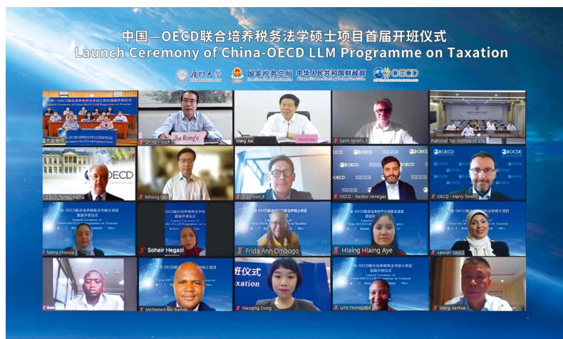
Launching ceremony of China-OECD LLM Program on Taxation

projects. In addition, Phase III of the China-FAO South-South Cooperation Trust Fund has also been officially launched. With these financial support, UN development agencies have carried out a series of practical projects in developing countries. For instance, the Global Development and South-South Cooperation Fund has supported the WFP's food assistance programs in Burkina Faso, Laos and Togo, the UNDP's post-COVID recovery assistance in Nepal and Pakistan, and emergency and basic medical programs and humanitarian assistance of the International Federation of Red Cross and Red Crescent Societies in Lebanon, Palestine and Syria during the COVID-19 pandemic.